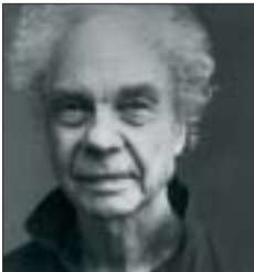
Merce Cunningham 1997

The exhibition will run until October 27.