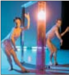
Paper House, Choreographer: Pascal Touzeau